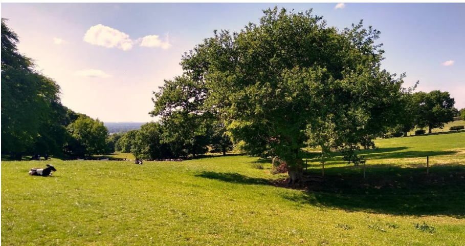
Summer time on Finlow Hill