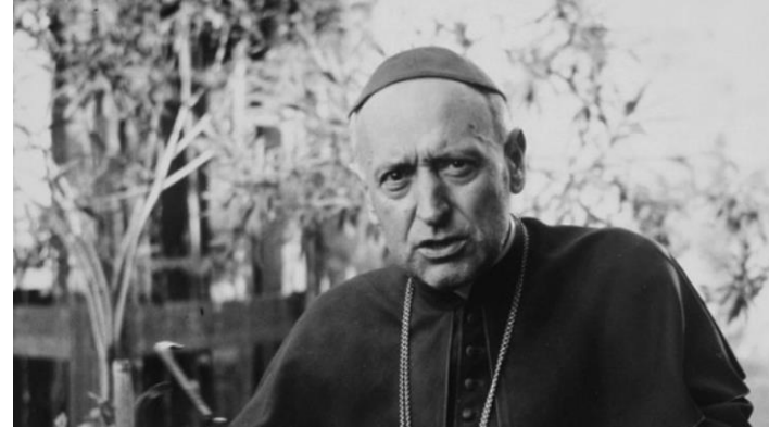
Cardinal Jozsef Mindszenty. 1892 – 1975.